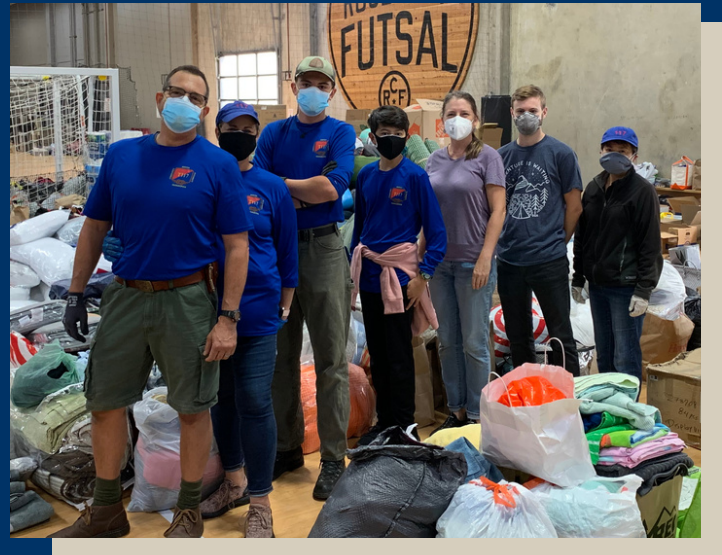
Thousands of Scouts helped safely collect and sort food for local food banks throughout the year.