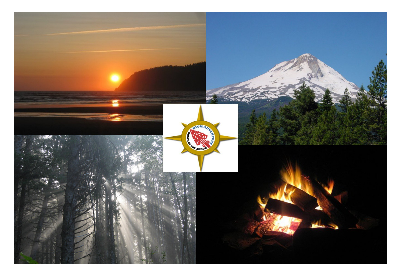
Cascade Pacific Council