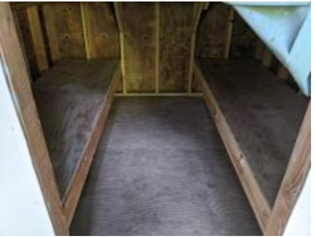
Wooden bunks mean you don't have to sleep on the floor!

All adult and youth attendees must follow current council COVID guidelines and pre-screening. See <u>cpcbsa.org/covid</u> for current practices.