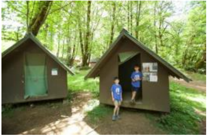
Our mini-dacks sleep two persons and their gear. The brand new shower house has individual stalls with a sink, toilet, and shower.

Firewood may or may not be available. You may bring firewood from home or collect dead and down firewood. Please do not gather wood from standing trees, living or dead.