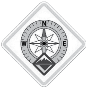
Discovery Award , cloth, No. 620502; Venturer; left pocket.