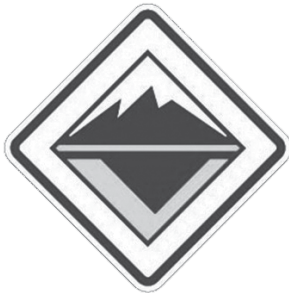
Venturing Award , cloth, No. 620501; Venturer; left pocket.