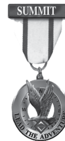
Summit Award , cloth, No. 620504; Venturer, left pocket; silver medal suspended from white and green cloth ribbon, No. 620565; adults wear only on formal occasions; embroidered silver knot on green and white, green to right, No. 5027, above left pocket.