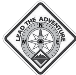
Pathfinder Award , cloth, No. 620503; Venturer; left pocket.